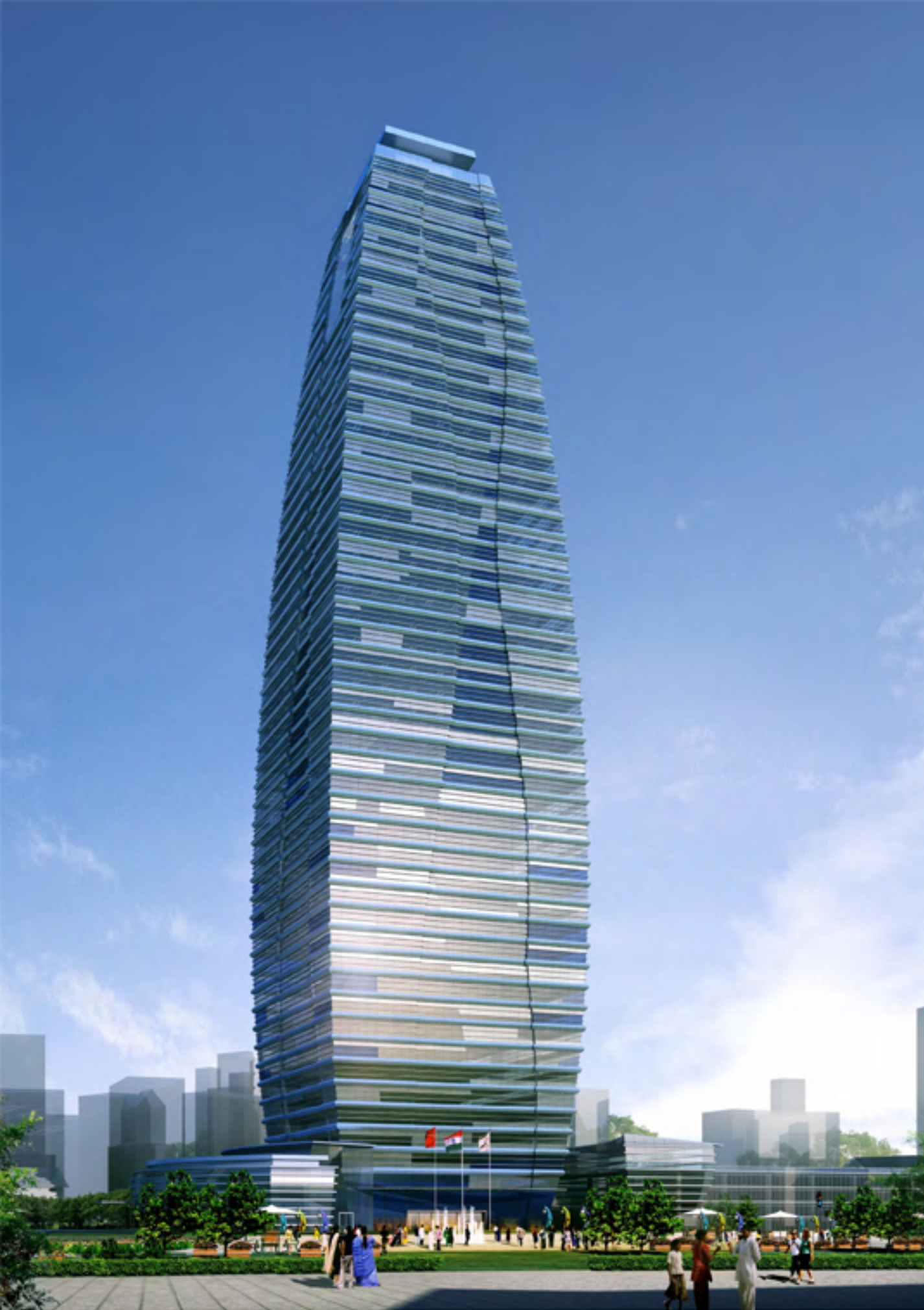
BICAR Proposed Conceptual Plan